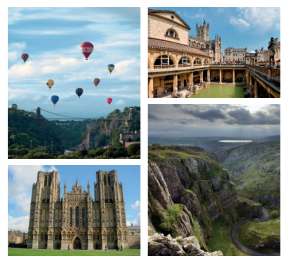
L to R (clockwise): The annual Bristol International Balloon Fiesta pictured over the famous Clifton Suspension Bridge, the Roman Baths in the World Heritage City of Bath, Cheddar Gorge and Wells Cathedral.